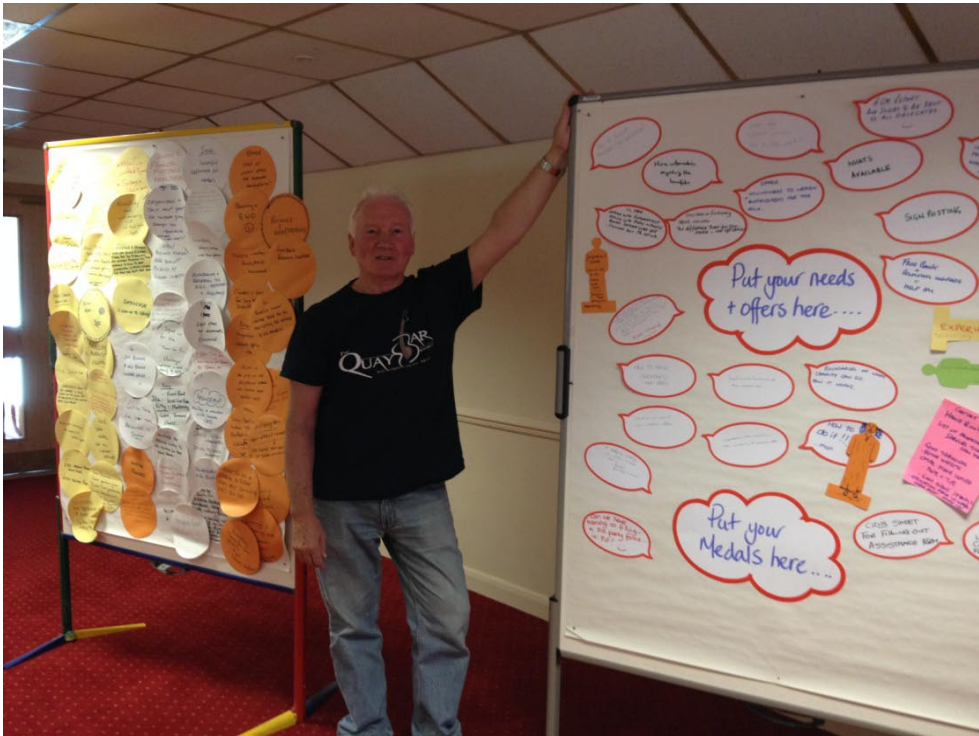
THERE FOR YOU - SUPPORTING UNISON MEMBERS WHEN LIFE GETS TOUGH