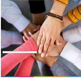
Supporting social workers in 2021